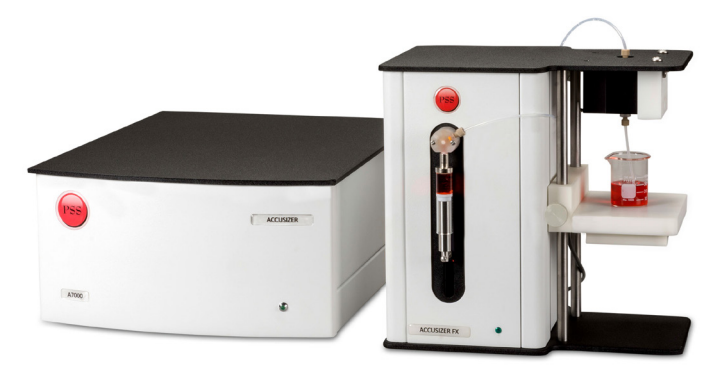
AccuSizer 7000 SIS system

The AccuSizer software is a sophisticated package that automates USP <788> testing including pass/fail criteria and acceptance approval.